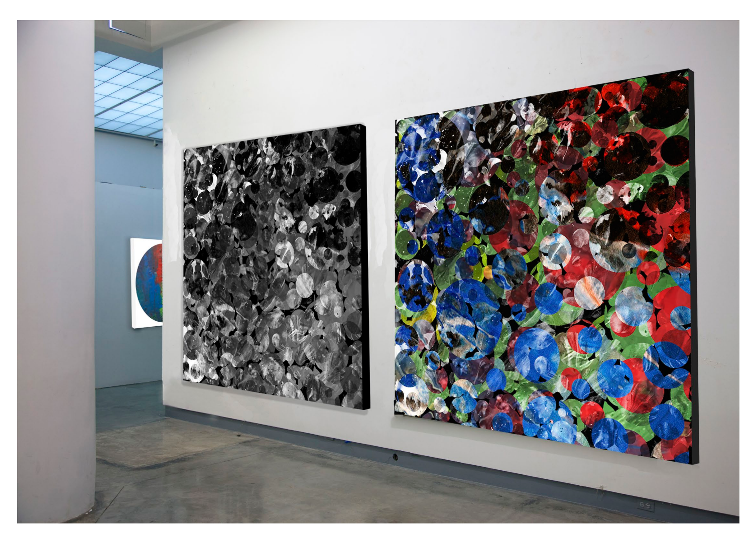
Fig. 1 Installation Mockup of Paul Kolker: tints and shades of gray decalcomania dot derivatives/12 synthèse, 2019 and tints and shades of color decalcomania dot derivatives/12 synthèse, 2019

Opening Reception Thursday, 6-8 PM November 21, 2019 511 West 25th Street