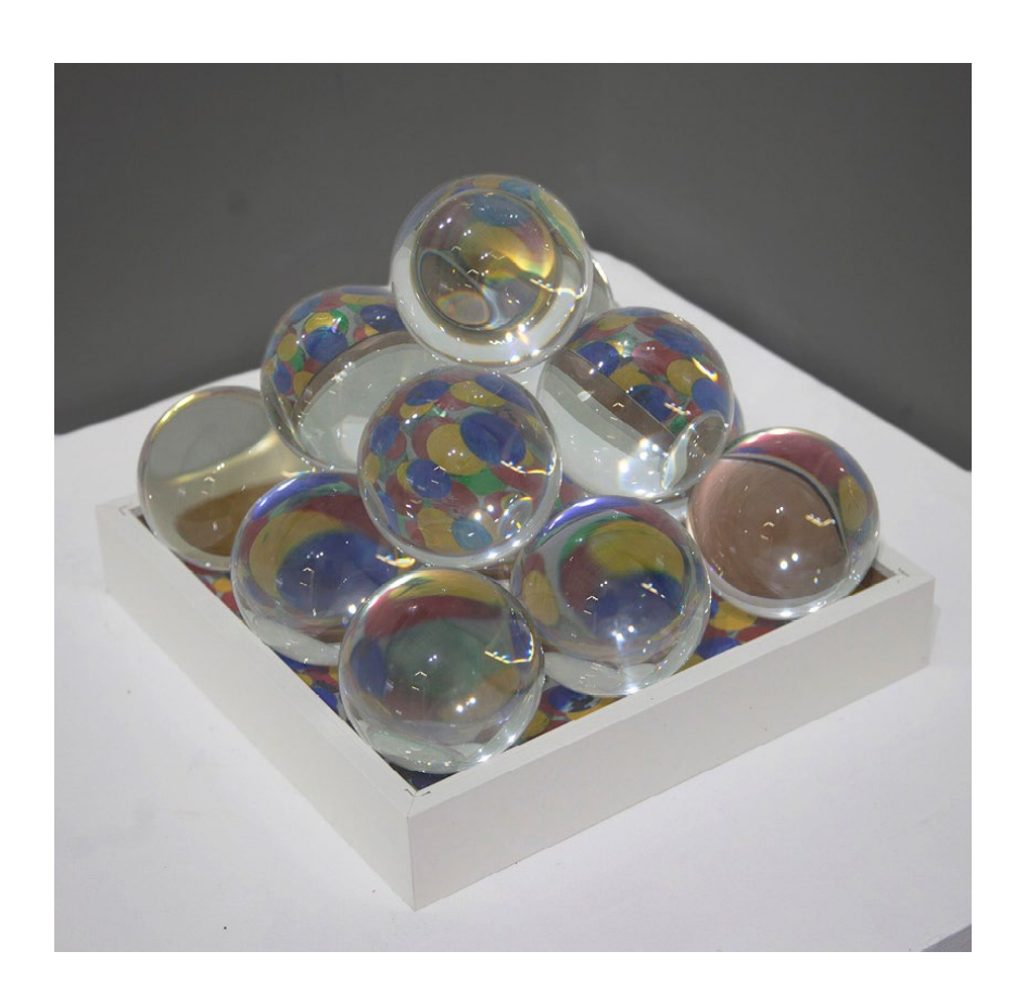
Fig. 3 Paul Kolker: about spherical space synthèse, 2019